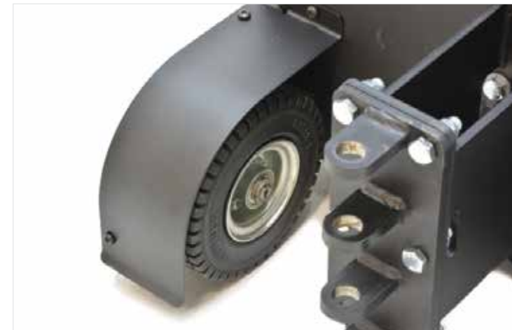
Superelastic rear wheels (special option)