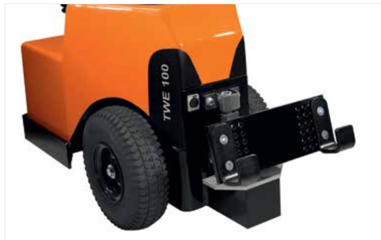
Load connection is easy, with a variety of attachments available