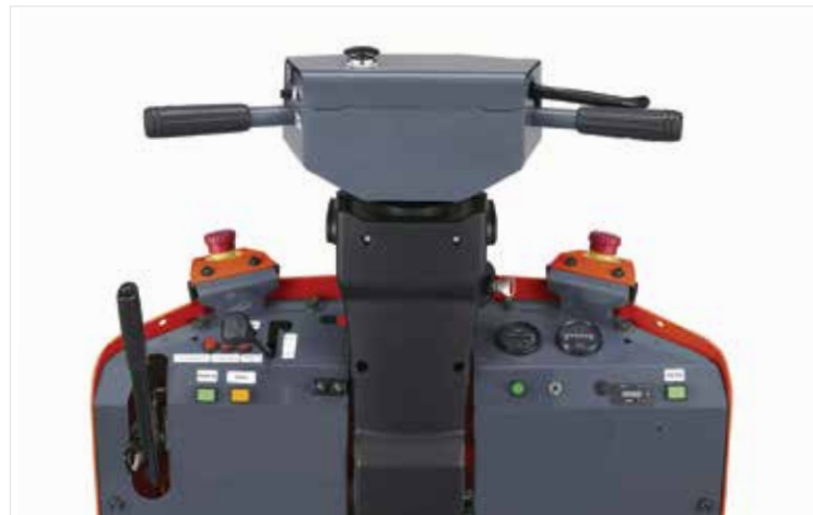
The control layout on the 4CBTYR is straightforward and easy to use