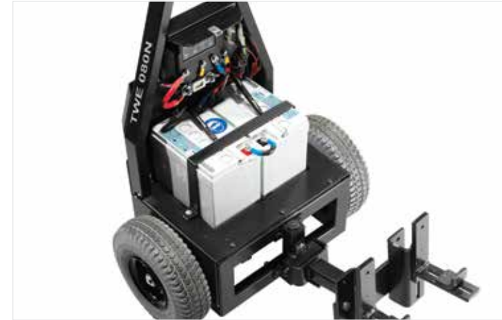
Maintenance-free gel batteries are fitted standard on the TWE080N