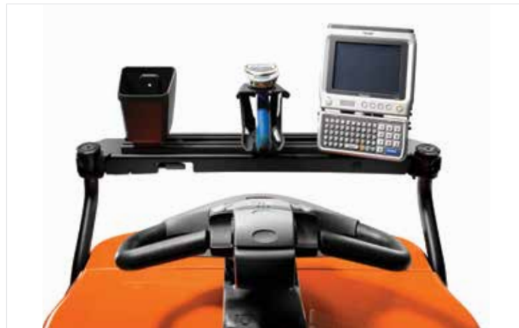
E-bar incorporates a power supply and allows easy attachment of essential equipment such as terminals and barcode scanners