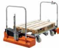
TAXI carrier Transporting subsidiary load offering train solutions for full-pallets and half-pallets

Typical load carriers that can operate with the Toyota Tracto S-series include: