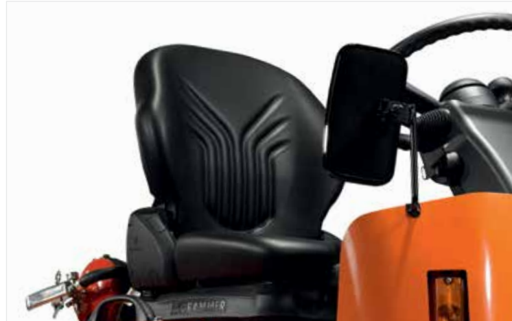
Toyota ORS seat