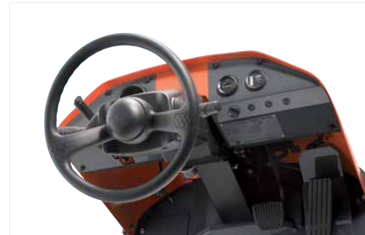
All Toyota Tracto R-series models feature simple, car-like controls