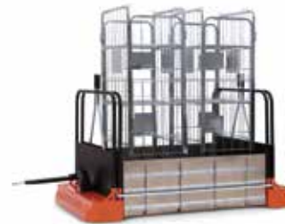
PLATFORM TAXI carrier Designed for easy and flexible transport of loads of different sizes like containers or roll cages