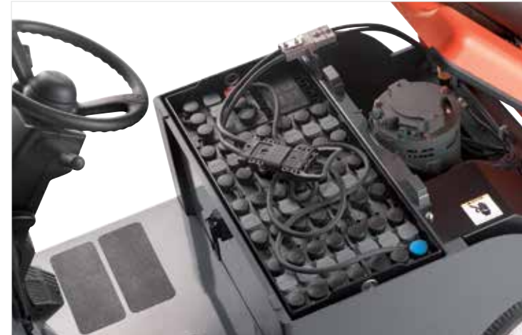
4CBT offers easy battery access