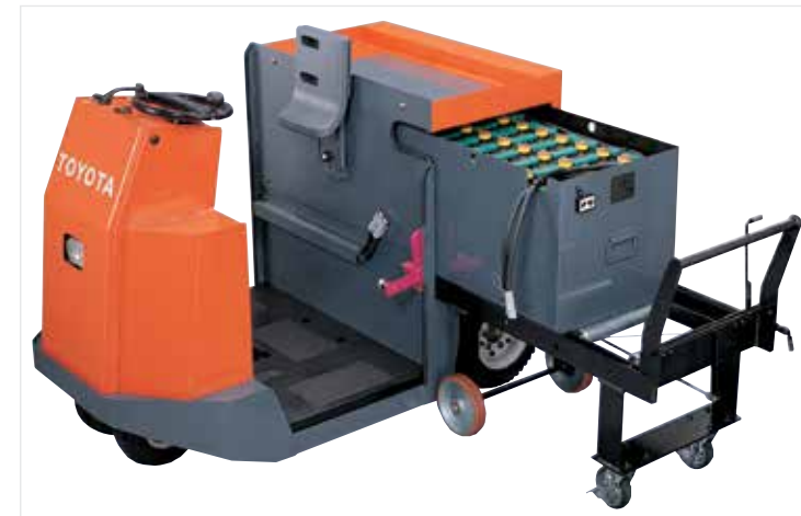
Battery roller-bed is standard on CBTY4 model