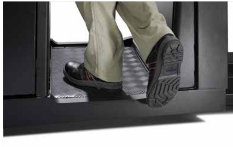
Low step-in and optional vibration-damped floor