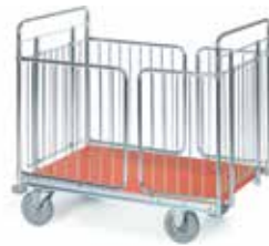
PARCEL carrier Designed for carriage of items of multiple sizes and shapes, with easy to open gates

Typical load carriers that can operate with the Toyota Tracto N-series include: