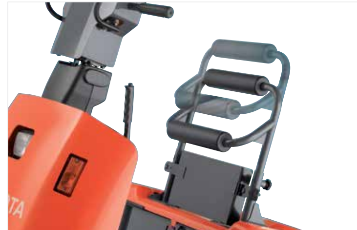
The backrest is height-adjustable to accommodate different operators in comfort. The backrest is height-adjustable to accommodate different operators in comfort