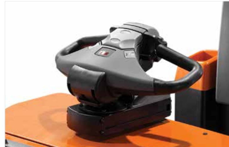
E-man control system can be moved to either side of the truck to facilitate 'walk-with' operation