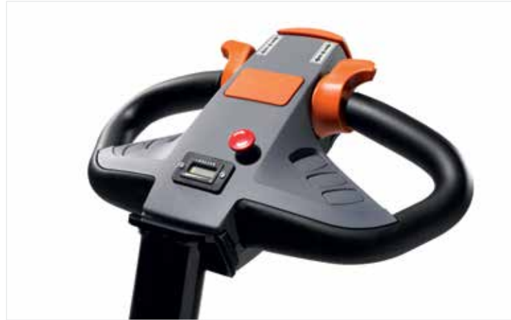
Control handle is comfortable and easy to use with a clear and concise battery status display