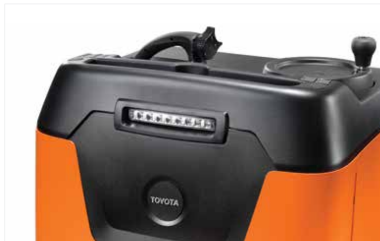
LED front light