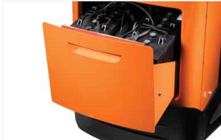
Fast and easy battery change