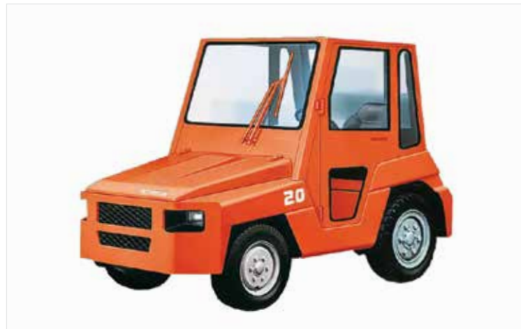
2TD20 with all-weather steel cab