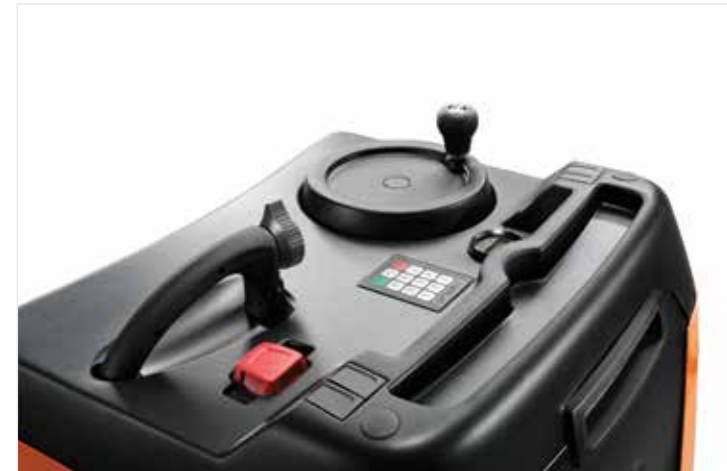
'Spinner wheel' steering and PIN-code access