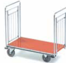
PLATFORM carrier Fast, easy and flexible transportation of stable goods