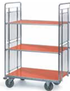
SHELF carrier Allowing sortation of items during the transportation process